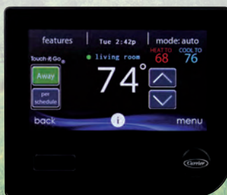
Infinity® System Control

* Full Infinity® System with the Infinity system wall control with Wi-Fi® capability. Remote access requires Wi-Fi model wall control and Apple® or Android® mobile device. Energy Tracking requires compatible equipment.